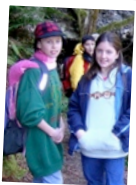
EAGLE TREK TRAVEL CAMP ($275) JULY 12-16, 2010