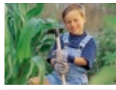
FARM AND GARDENS DAY CAMPS ($125) AUGUST 9-13