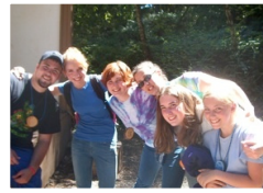
TEEN COUNSELOR CAMP (FREE) MAY 15-16, 2010