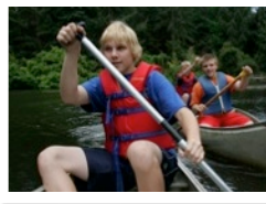
WILDLIFE STEWARDS CAMP ($275) AUGUST 3-7, 2010