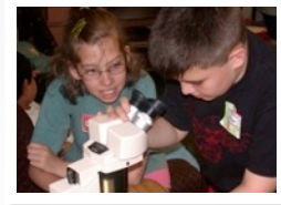
SUPER SCIENCE CAMP ($275) AUGUST 16-20, 2010