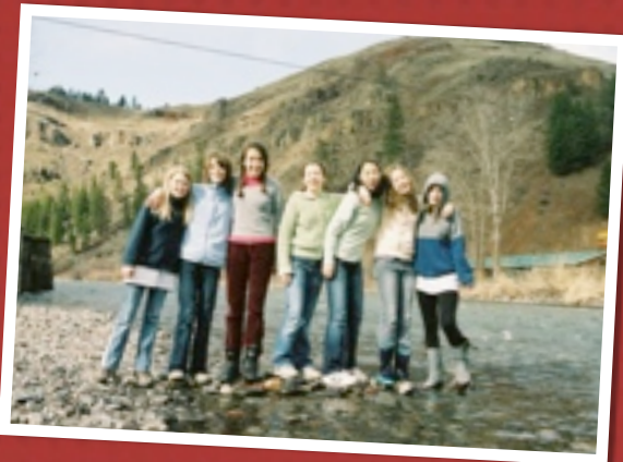
EAGLE Trek Travel Camp travels to the coast, the mountains, and forests throughout the Oregon.

The health and safety of campers are closely monitored. Each camp provides nutritious and balanced meals. The sites have hot and cold running water, showers, and flush toilets. There are medical personnel on staff to attend to participants' health needs.