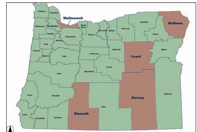
Map of Oregon shows current participating counties